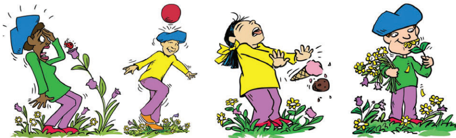
FIGURE 1 | Sample illustrations of ‘Zarpies’ from Rhodes et al. 31 . Zarpies were designed to be diverse for sex, race, and age, so that the category would not easily map onto one for which children might already hold essentialist beliefs. During the first phase of the experiment, children were shown 16 individual Zarpies, one at a time. Text accompanied each illustration, which varied by condition. For example: generic condition: ‘Look at this Zarpie! Zarpies are scared of ladybugs’; specific condition: ‘Look at this Zarpie! This Zarpie is scared of ladybugs’; no label condition: ‘Look at this one! This one is scared of ladybugs.’ In Study 1 of Rhodes et al. (2012) children were read the 16 page book (each introducing a unique Zarpie with a unique property using language determined by the child’s condition) twice on the first day of research, twice on a second day of research (approximately 3 days later). On a third day of research (approximately 3 days later), children completed a series of test questions assessing the extent to which they held essentialist beliefs about Zarpies. (Reprinted with permission from Ref 31. Copyright 2012 National Academy of Sciences)

Subsequently, in the non-generic conditions, children (and adults) reliably rejected essentialist beliefs about Zarpies after exposure to the book. That is, although they learned the category ‘Zarpie,’ they did not expect Zarpie properties to be determined by birth, they did not expect individuals to do certain behaviors because they are Zarpies, and they did not expect all Zarpies to share either the properties mentioned in the book or other new properties. In contrast, the Generic condition significantly increased the likelihood of these essentialist beliefs among both preschool-age children and adults, with effects persisting for at least several days after exposure to the generic language (see Figure 2). Follow-up control studies confirmed that it was the genericity of the target sentences—not simply their syntactic plurality—that elicited these effects (e.g., indefinite singular generics, such as ‘ A Zarpie sleeps in tall trees’ had similar consequences as bare plural generics, ‘ Zarpies sleep in tall trees’). Thus, preschool-age children appear to require stronger linguistic cues—in this case, generic language—to assume that new social categories are essentialized kinds.